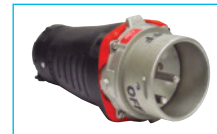
Male Inlet with Handle (Plug) 39-98243-K04 + 65-9A013-D25

A typical order should include an inlet part number, a receptacle part number AND the matching handles, angles or other required accessories.