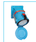
Female Receptacle with Angle Adapter 39-94243-K04 + MA10